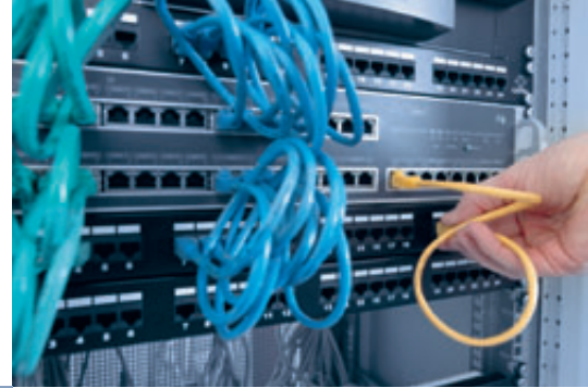
INTUS ACM8e Rack with Patch-Panel

As the control center for an access control system, the Access Control Manager is equipped with a powerful computer and integrated with a security system based on distributed intelligence. Supplied with variable master data from a central host, the Access Control Manager uses predefined time/area profiles to decide whether a door is to be opened or to stay closed. Even if the network connection to the host fails, the Access Control Manager reliably controls the connected access readers, the doors with their monitoring contacts, the barriers and turnstiles or the attached video recorder. Decentralized intelligence for powerful failure protection. For your security.