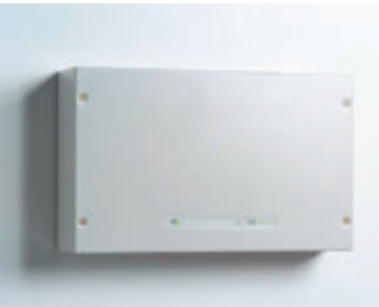
INTUS ACM8e Wall